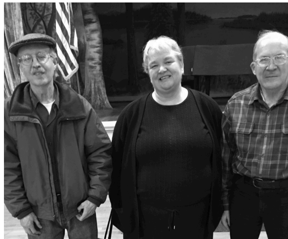
Welcome new members