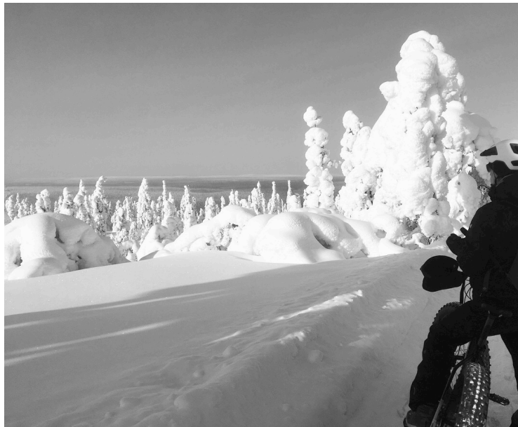
A biker enjoying the scenery in Finnish Lapland, March 2018